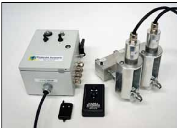
Optional Remote Control Flow Control Valve Units. Operate multiple pumps from a hand-held RF control.