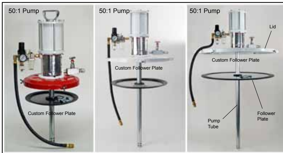
( LB3 ) Grease Pump Fits: 35 lb. Pail

The only difference between the grease pumps is the tube length, lid size & follower plate size for the 3 container sizes.