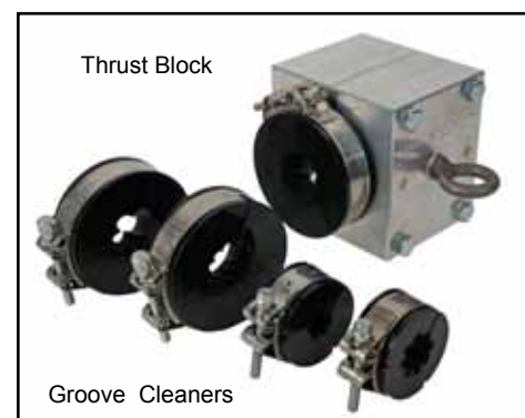
Optional Thrust Block